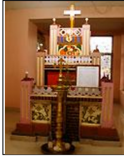
SACRED TOMB OF MOR COORILOS YUYAKKIM AD 1874, Mulanthuruthy