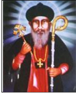
MAPHYONO MOR BASELIOS SHAKRALLA AD 1764, Kandanad