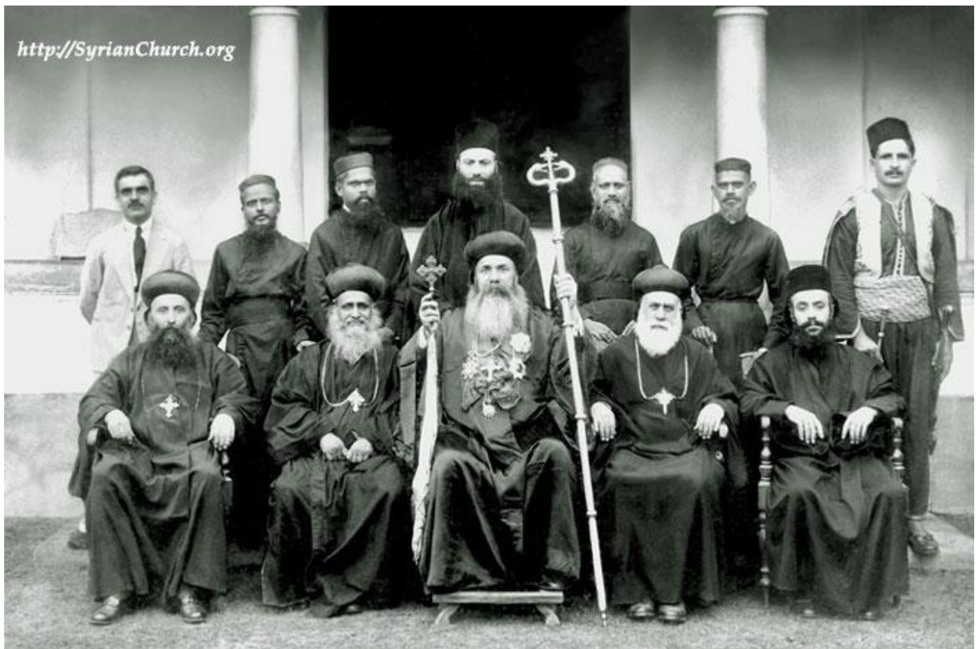
Photo taken in 1931 when Patriarch St. Ignatius Elias III of Manjinikkara stayed at the Thrikkunnathu Seminary, the then headquarters of the Malankara Jacobite Syrian Church.

Malankara Metropolitan St. Athanasius Paulose (Valiya Thirumeni) is sitting next to the Patriarch. Also seen in the photo are the two Suryoyo Metropolitans, Rambans and priests