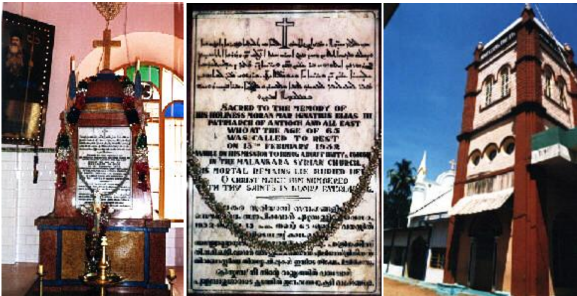
Tomb of Patriarch Elias III at Manjinikkara.

On October 20, 1987, Patriarch Mor Zakka I through encyclical E265/87 permitted the Church in Malankara to remember his name in the fifth diptych.