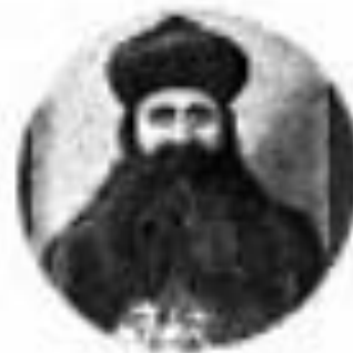
His Eminence Illarion