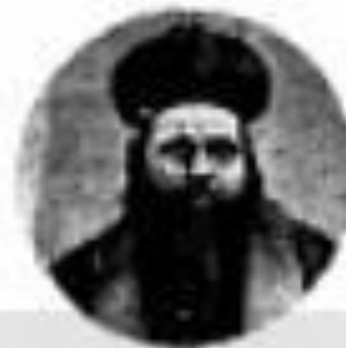
His Eminence Tikhon