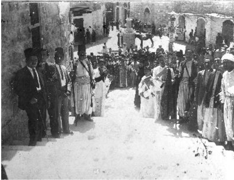
Patriarch Mor Elias III at Bethlehem in 1924.

Mustafa Keman Pasha assumed leadership of the newly formed democracy, Mor Elias III spent a few months in Jerusalem. He established a printing press there and began publication of journals in Syriac and Arabic.