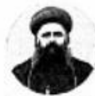
His Eminence Tikhon