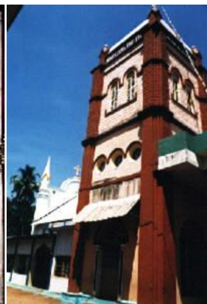
Tomb of Patriarch St. Ignaius Elias III at Manjinikkara.