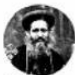
His All-Holiness Daniel